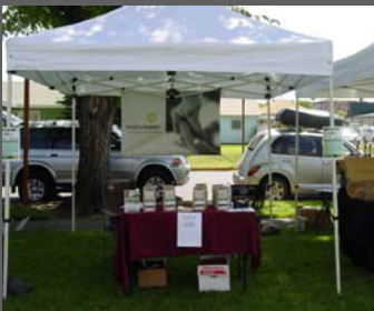
NeighborImpact set up a booth at the Redmond Farmer's Market last summer selling coffee and giving out information